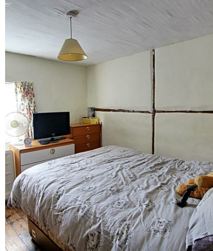
A charming character cottage in need of modernisation.